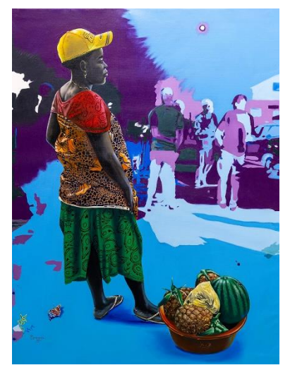
3. Théo Mwamba, Mwasi bouliste (2023) Oil on canvas 120 x 90 cm © T. Mwamba

Galerie Angalia 10-12 rue des Coutures Saint Gervais 75003 Paris - France Open Tuesday to Saturday Tuesday 12pm - 7pm Wed. to Sat. 11am - 7pm 07 81 72 30 62 galerie-angalia.com