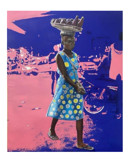
4. Théo Mwamba, Rond-point huilerie (2023) Print, oil and acrylic on canvas 120 x 100 cm © T. Mwamba