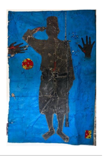
2. Catheris Mondombo, A vos ordres! (2021) Mixed media on used tarpaulin, 200 x 150 cm