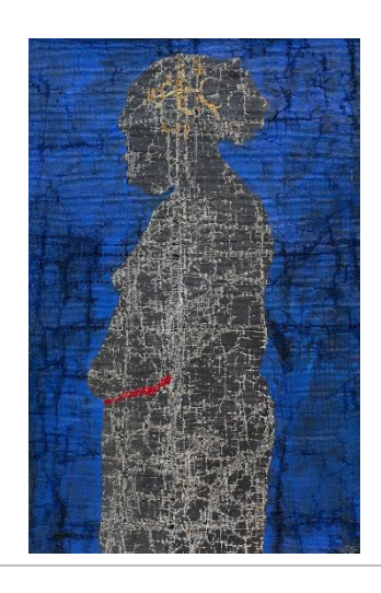
4. Catheris Mondombo, Naissance (2023) Mixed media on used tarpaulin, 128 x 88 cm © PCP - Courtesy C. Mondombo & Angalia