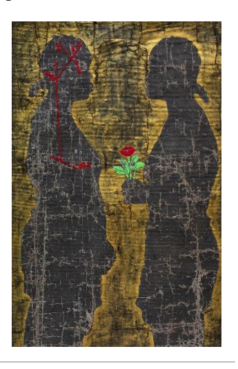
5. Catheris Mondombo, Regard vers le passé (2023) Mixed media on used tarpaulin, 127 x 88 cm

Galerie Angalia 10-12 rue des Coutures Saint Gervais 75003 Paris Open Tuesday to Saturday Tue. 12h - 19h Wed. to Sat. 11am - 7pm 07 81 72 30 62 galerie-angalia.com