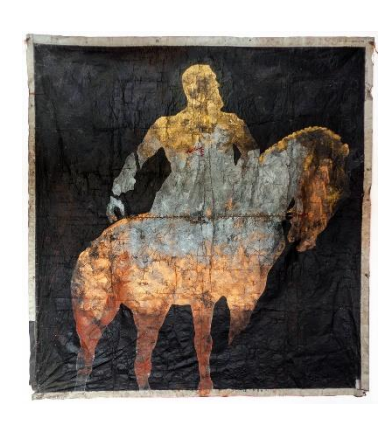
1. Catheris Mondombo, Le roi du Congo belge (2021) Mixed media on used tarpaulin, 230 x 280 cm