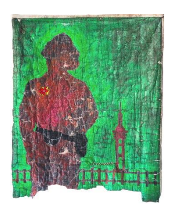
3. Catheris Mondombo, Sans le chemin de fer... (2021) Mixed media on used tarpaulin, 177 x 147 cm

Visuals of the works in the exhibition are available on request