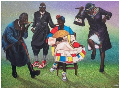
4. Amani Bodo, La vieillesse attendra (2022) Acrylic on canvas, 139 x 189 cm © PCP - Courtesy A. Bodo & Angalia