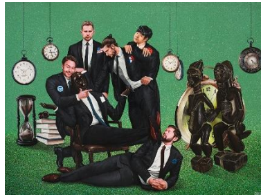
5. Amani Bodo, Qui est derrière toi ? (2023) Acrylic on canvas, 149 x 187 cm © PCP - Courtesy A. Bodo & Angalia