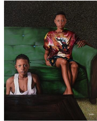
3. Amani Bodo, Congo avenir (2023) Acrylic on canvas, 130 x 102 cm © PCP - Courtesy A. Bodo & Angalia