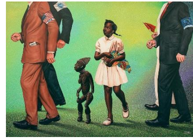
Amani Bodo, Afrique bien protégée (2022) Acrylic on canvas (133 x 183 cm)